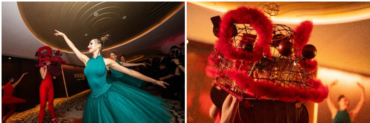
ABOVE (LEFT TO RIGHT): CAPTIVATING BALLET PERFORMANCE, CONTEMPORARY ADAPTATION OF THE TRADITIONAL LION DANCE